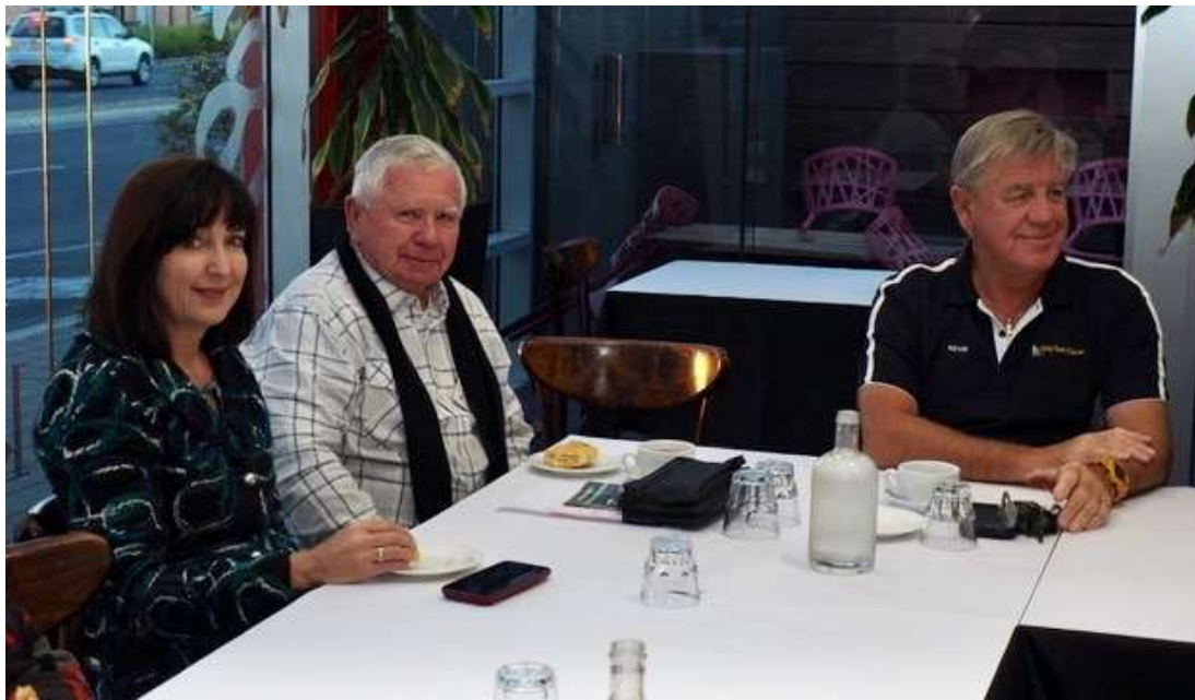
More photos from the successful Open For Business Breakfast meeting.