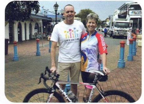
Lift the Lid on mental illness campaign raises annual funds for mental health research through ARH

Mental illnesses are just like other illnesses such as heart disease, diabetes and asthma. Unfortunately, the sympathy and support provided to people with a physical illness is often denied to those with a mental illness.