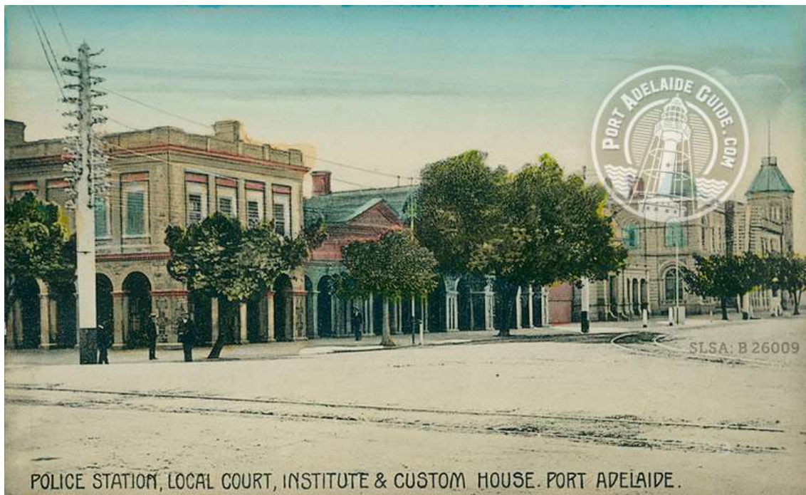
POLICE STATION, LOCAL COURT, INSTITUTE & CUSTOM HOUSE. PORT ADELAIDE.